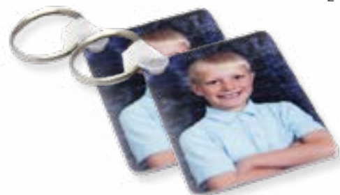
Double-Sided Metal Keychain - $10.17 Double-Sided Metal Keychains (2 up) - $18.66