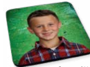
Coaster - $11.36 each Set of 4 - $36.78