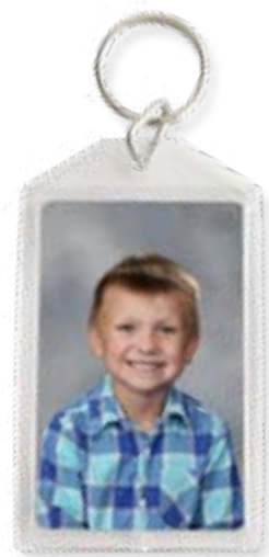
2" Plastic Double-Sided Keychain - $2.51