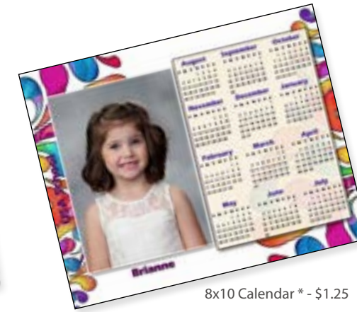
8x10 Calendar * - $1.25