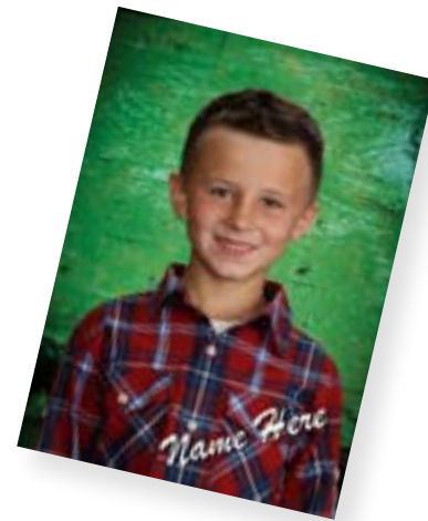
Signature Wallets (8 up) - $1.25