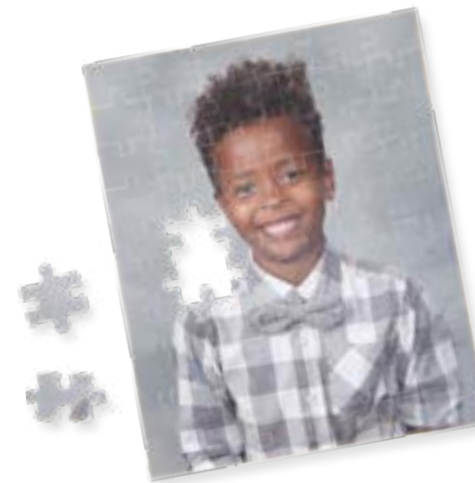
8x10 Puzzle - $9.77