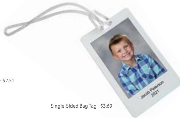
Single-Sided Bag Tag - $3.69