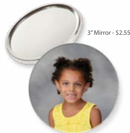
3" Mirror - $2.55