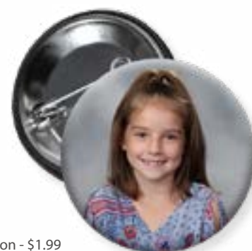
3" Button - $1.99 3" Button (2 up) - $3.34