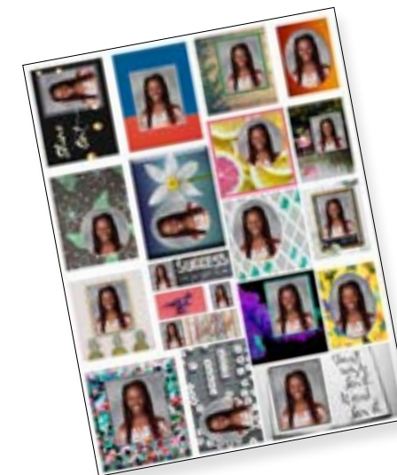
Sticker Sheet* - $2.02 per sheet Includes 19 different stickers