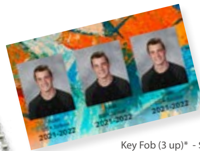
Key Fob (3 up)* - $3.05