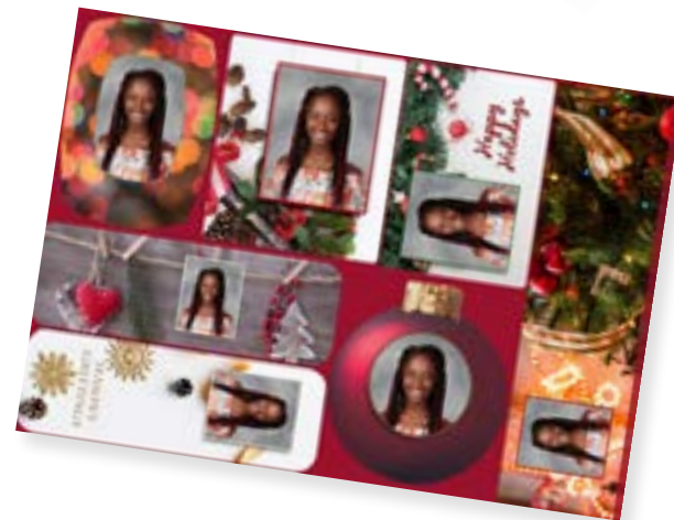
Laminated Fun Pack* - $5.11 each Includes 2 magnets, a ruler, 2 bookmarks, and 2 bag tags