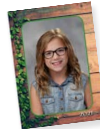
Designer Wallets (8 up) - $1.25