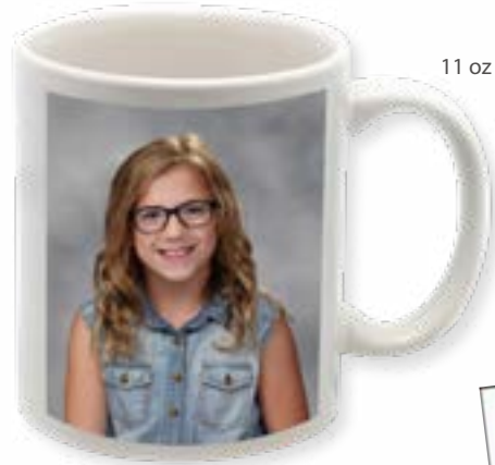
11 oz Coffee Mug - $16.60

Lab time varies upon product. Visit our website for more product listings.