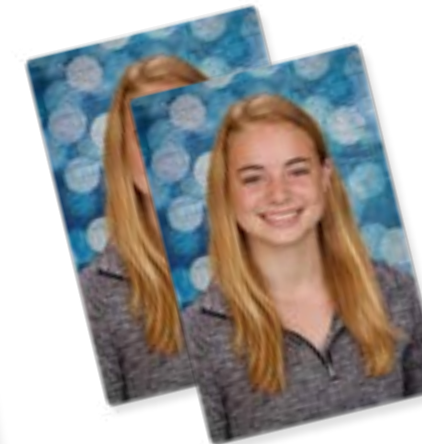
Wallet Sized Magnet - $2.40 Wallet Sized Magnets (2 up) - $4.07 Wallet Sized Magnets (4 up) - $6.15