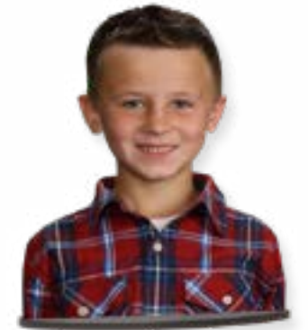
5x7 Black Statuette (1 head) - $18.32 5x7 Clear Statuette (1 head) - $17.03 8x10 Black Statuette (1 head) - $26.37 8x10 Clear Statuette (1 head) - $20.26