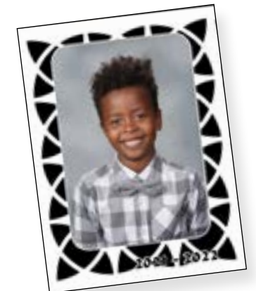
Graphic Wallets (8 up) - $1.25