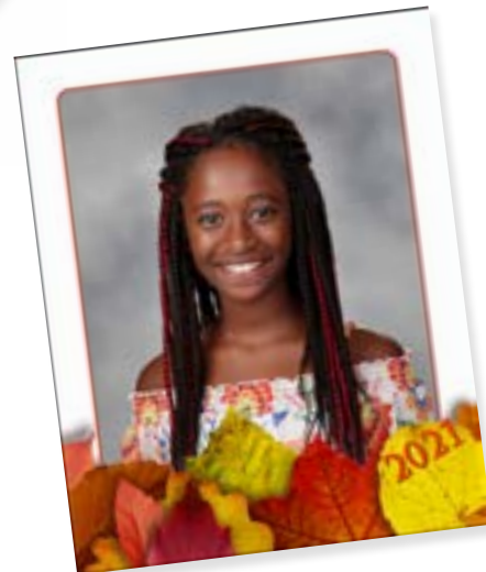
8x10 Keepsake Design - $1.25