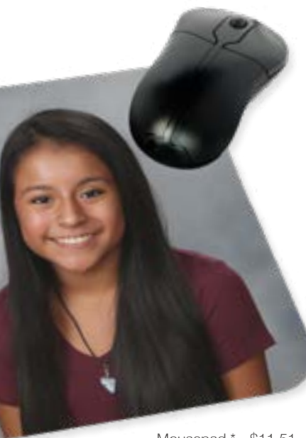
Mousepad * - $11.51