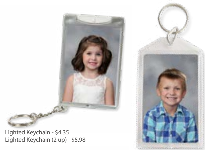
Lighted Keychain - $4.35 Lighted Keychain (2 up) - $5.98