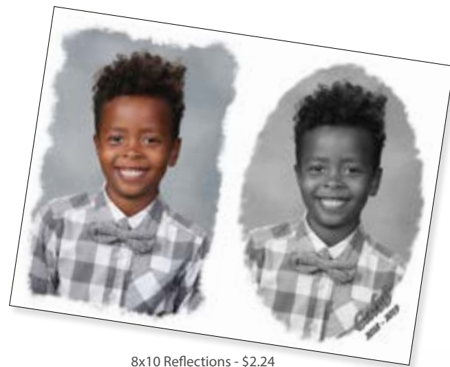
8x10 Reflections - $2.24