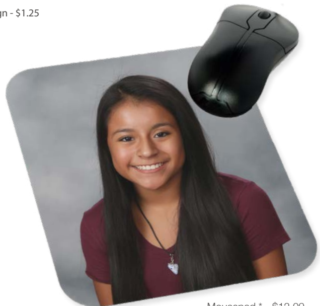
Mousepad * - $12.09

Single-Sided Photo Dog Tag with Chain (no silencer) - $9.69 each* Double-Sided Photo Dog Tag with Chain (no silencer) - $12.88 each