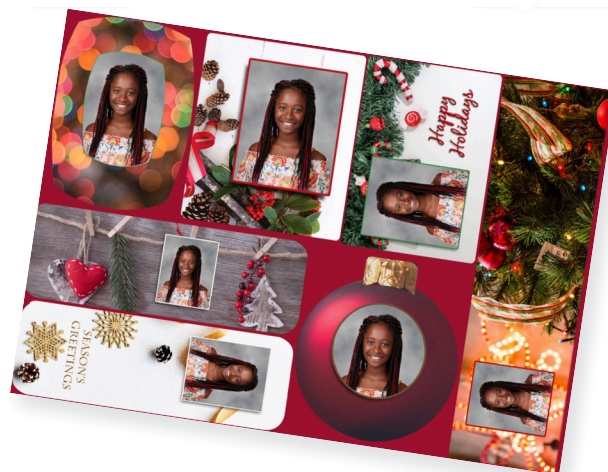
Laminated Fun Pack* - $5.26 each Includes 2 magnets, a ruler, 2 bookmarks, and 2 bag tags