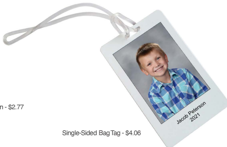
Single-Sided Bag Tag - $4.06