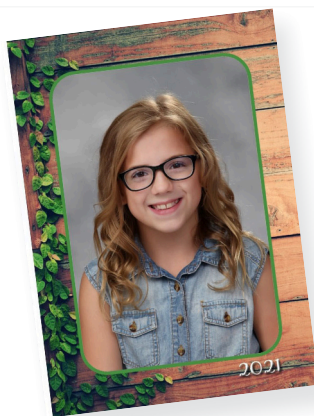
Designer Wallets (8 up) - $1.29