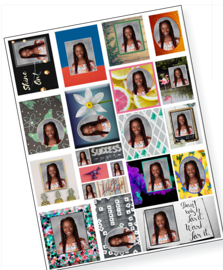
Sticker Sheet* - $2.08 per sheet Includes 19 different stickers