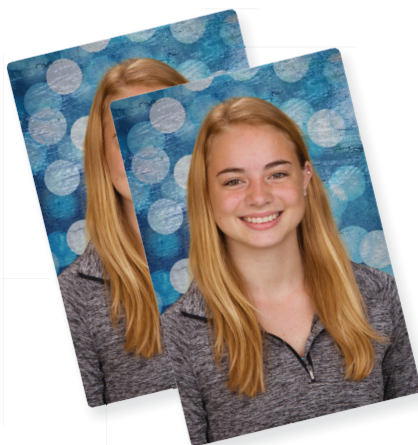
Wallet Sized Magnet - $2.47 Wallet Sized Magnets (2 up) - $4.19 Wallet Sized Magnets (4 up) - $6.33