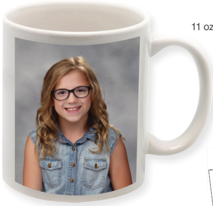
11 oz Coffee Mug - $18.30

Lab time varies upon product. Visit our website for more product listings. Images © Cahill Studios and © Canfield Jenkins House of Photography