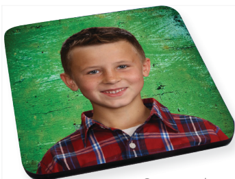
Coaster - $12.53 each Set of 4 - $40.55