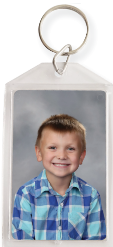
2" Plastic Double-Sided Keychain - $2.77