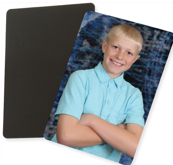
Large Magnet (3.25"x4.75") - $2.80 Large Magnet (3.25"x4.75") (2 up) - $4.21