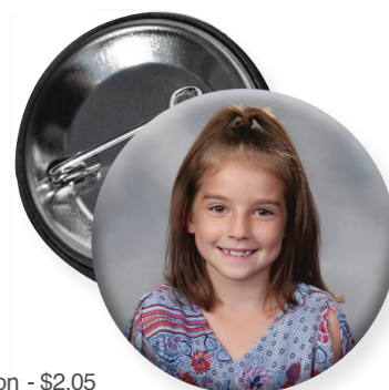
3" Button - $2.05 3" Button (2 up) - $3.44