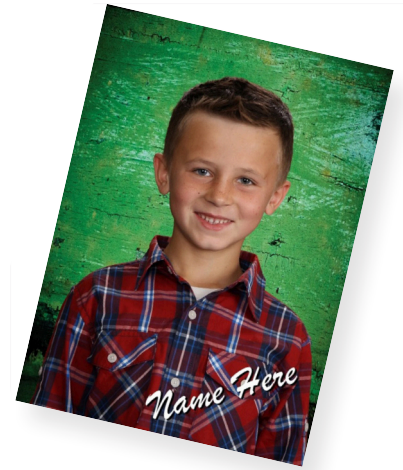
Signature Wallets (8 up) - $1.29

5 x10 Dry Erase Board (available upon request) - $11.83 8x10 Dry Erase Board (available upon request) - $12.59