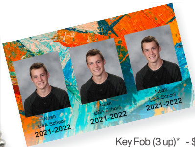
Key Fob (3 up)* - $3.36