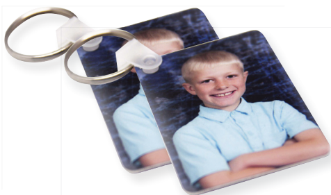
Double-Sided Metal Keychain - $11.63 Double-Sided Metal Keychains (2 up) - $21.35