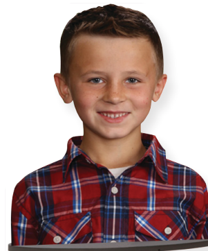
5x7 Black Statuette (1 head) - $20.20 5x7 Clear Statuette (1 head) - $18.77 8x10 Black Statuette (1 head) - $29.07 8x10 Clear Statuette (1 head) - $22.33