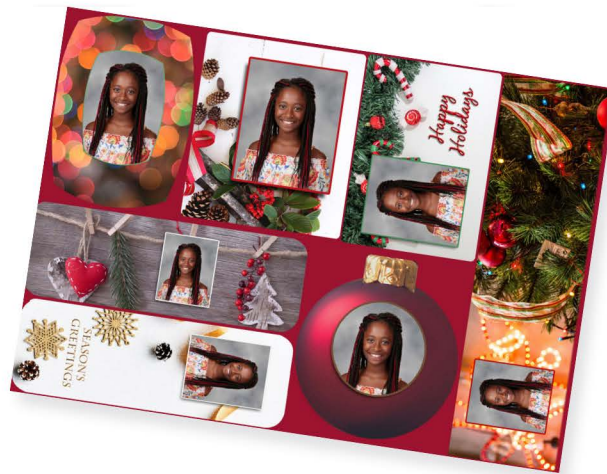
Laminated Fun Pack* - $5.26 each Includes 2 magnets, a ruler, 2 bookmarks, and 2 bag tags