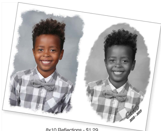
8x10 Reflections - $1.29