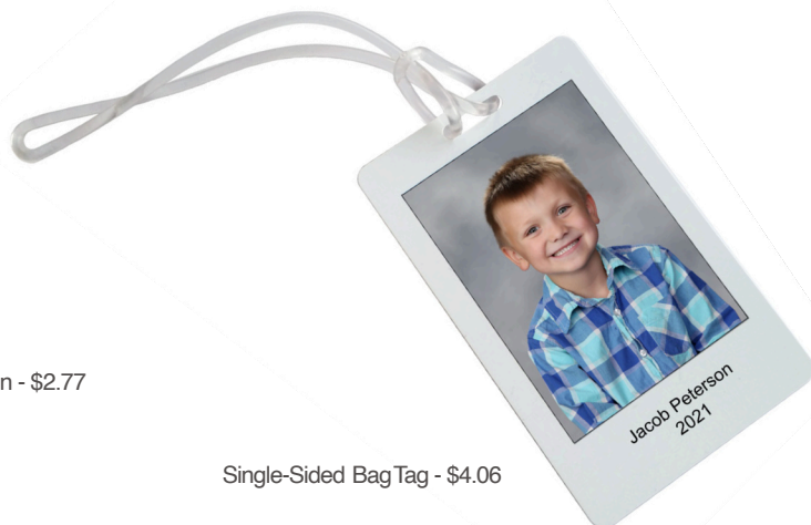
Single-Sided Bag Tag - $4.06