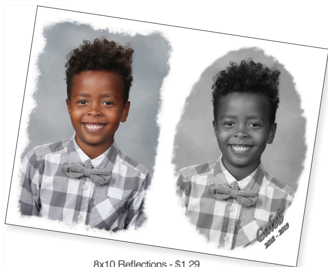
8x10 Reflections - $1.29