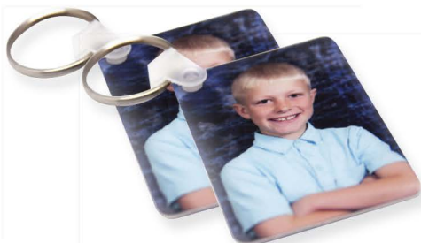
Double-Sided Metal Keychain - $11.63 Double-Sided Metal Keychains (2 up) - $21.35