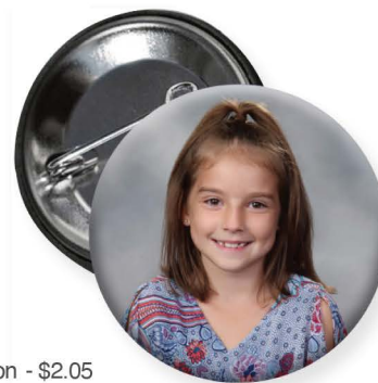
3" Button - $2.05 3" Button (2 up) - $3.44