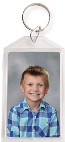
2" Plastic Double-Sided Keychain - $2.77