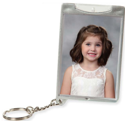
Lighted Keychain - $4.80 Lighted Keychain (2 up) - $6.59