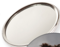
3" Mirror - $2.76