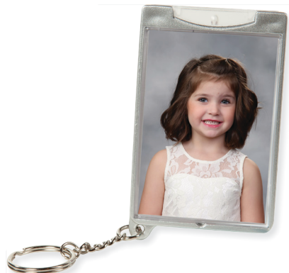
Lighted Keychain - $4.80 Lighted Keychain (2 up) - $6.59