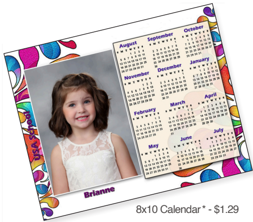
8x10 Calendar* - $1.29