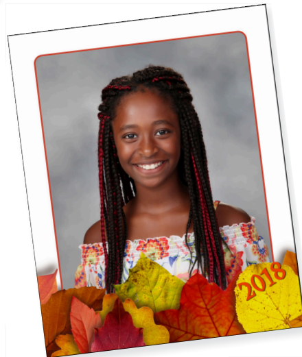
8x10 Keepsake Design - $1.29