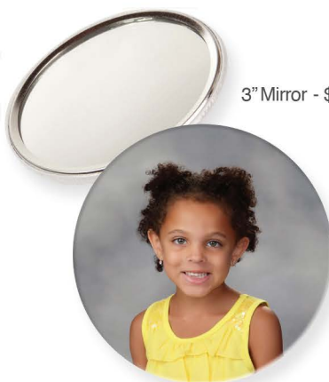
3" Mirror - $2.76