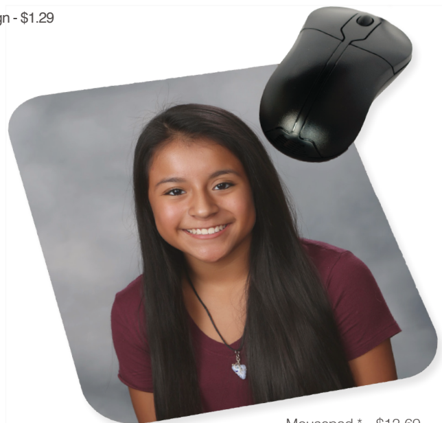
Mousepad * - $12.69

Single-Sided Photo Dog Tag with Chain (no silencer) - $10.17 each* Double-Sided Photo Dog Tag with Chain (no silencer) - $13.52 each