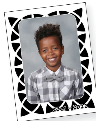
Graphic Wallets (8 up) - $1.29